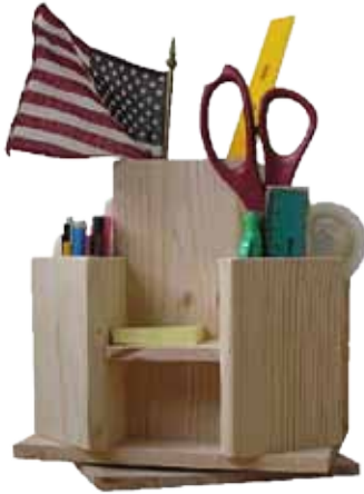
Rotating Desktop Organizer

360- rotation with 5 compartments, including a large deep one in the center, optional shelf for note pads and optional screw for holding tape.